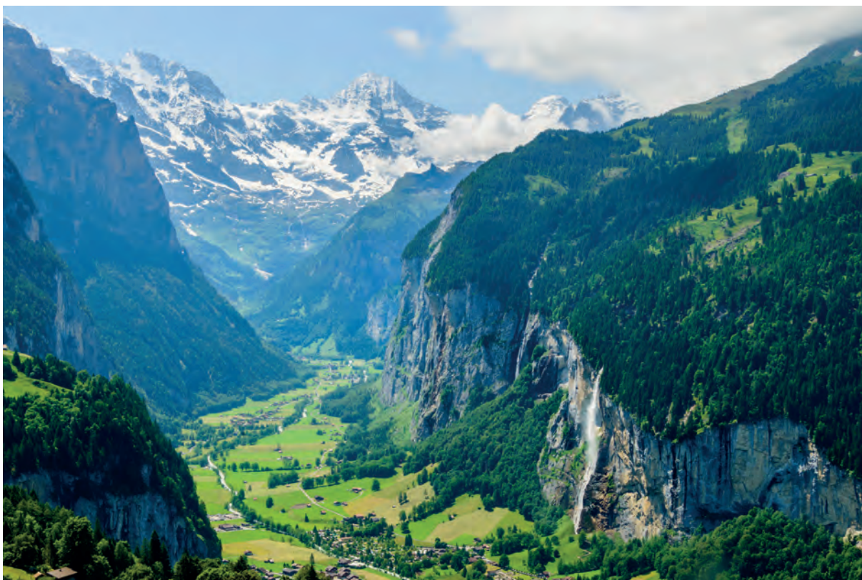
Fig. 5 – An area in which it is proposed to carry out an AS level geographical investigation